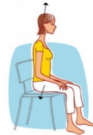
Chair Yoga Monday & Thursday @ 3 PM

muscles. We are all having a good time and need more participation to keep it going.